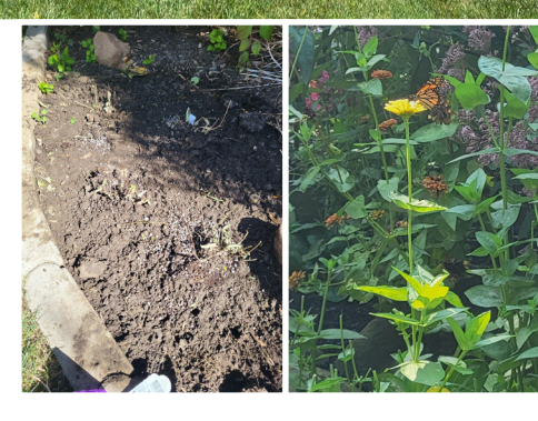
Left: Oxeye sunflower (Heliopsis helianthiodes) surrounded by 'Goldenblitz' Black-eyed Susans in my backyard.

Right: The first monarch butterfly I saw this year perched upon one of the zinnias I planted in the Butterfly Garden at Cleveland Botanical Garden.