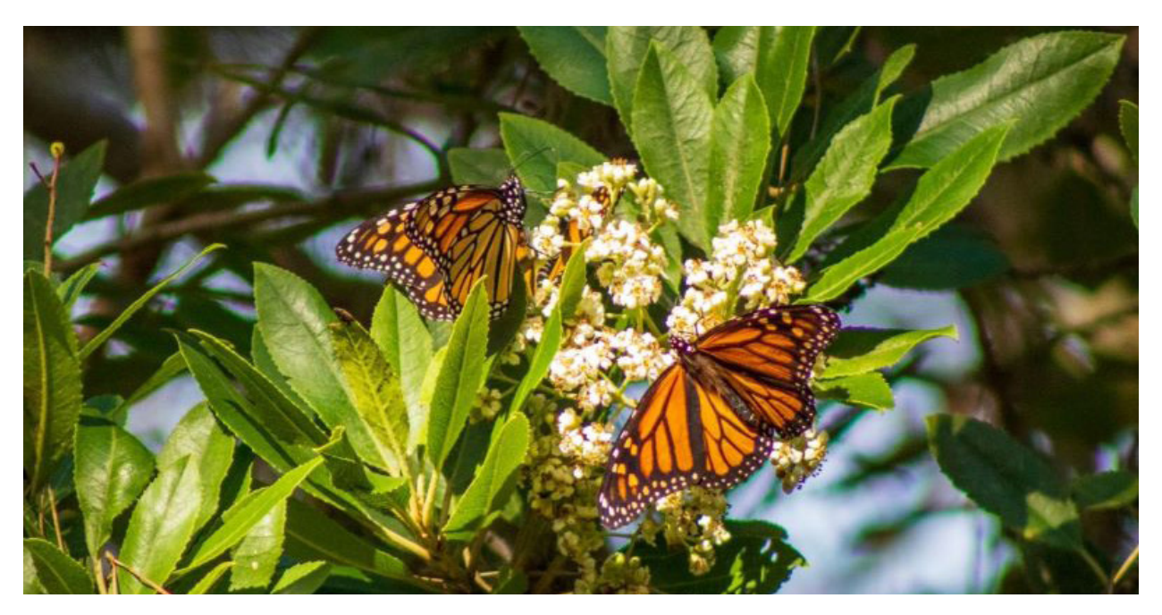
Two monarch butterflies rest on a flower cluster in Pacific Grove, CA in 2022. Monarch overwintering sites in coastal California are likely to be named critical habitat.

By Sarah Nizzi, President, Iowa Native Plant Society