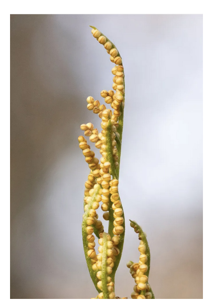
Small yellow globes are filled with spores.

It was cutleaf grapefern, Sceptridium dissectum. It was less than a foot tall, festooned with delicate chains of gold. A closer look, the chains resolved into strings of tiny spheres — like miniature grapes. However, these are not fruits. These are sporangia, reproductive structures of ferns, each containing many microscopic spores.