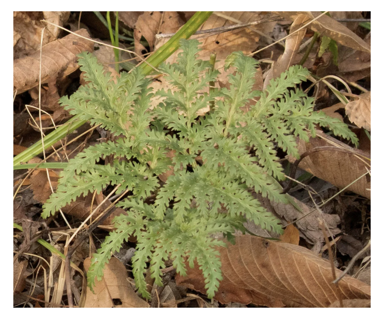
The sterile, leafy frond does photosynthesis to nourish the whole fern.