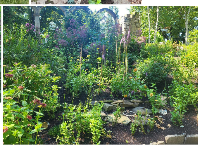
Above: The Butterfly Garden at Cleveland Botanical Garden that I installed annuals in.

Right: The first monarch butterfly I saw this year perched upon one of the zinnias I planted in the Butterfly Garden at Cleveland Botanical Garden.