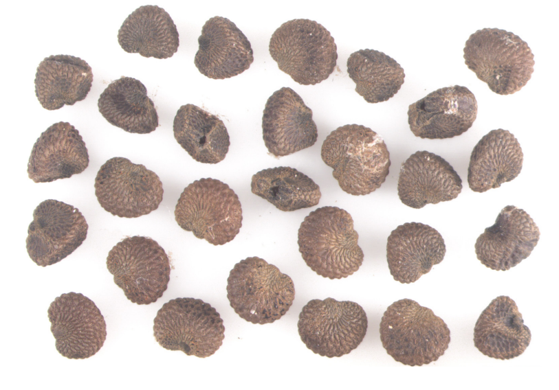
Seeds of the Starry Campion, Silene stellata.

The above Hadena ectypa Iowa locations can be viewed on Jim Durbin's Insects of Iowa website at <a href="https://www.insectsofiowa.org/taxon/hadena_ectypa">https://www.insectsofiowa.org/taxon/hadena_ectypa</a> and BugGuide at <a href="https://bugguide.net/adv_search/bgsearch">https://bugguide.net/adv_search/bgsearch</a>.