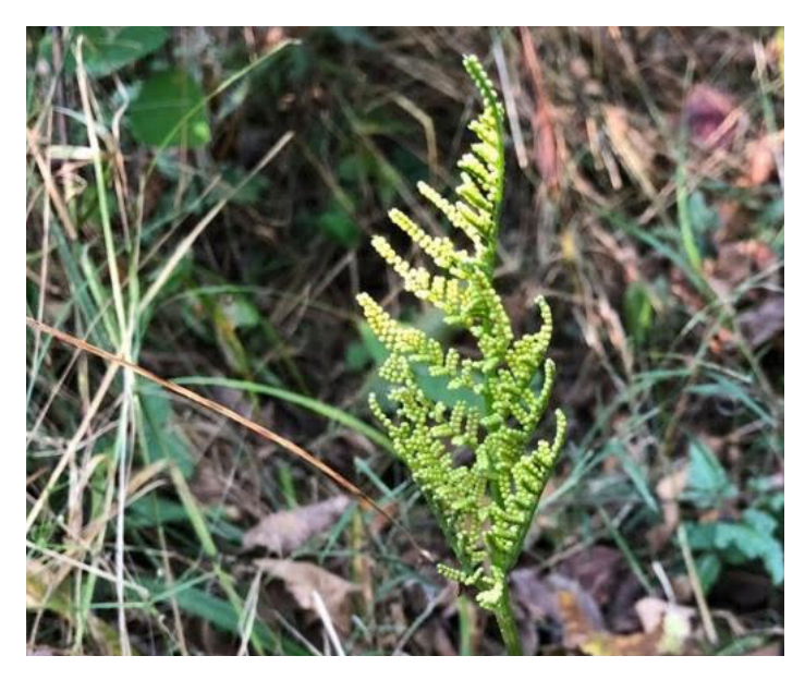
In fall, a taller stalk of sporangia appears, bearing the golden orbs that contain spores.