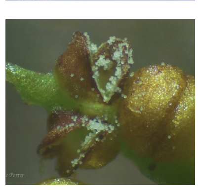
Sporangia resemble golden grapes. Everything in this magnified view would fit under the tip of my little finger.