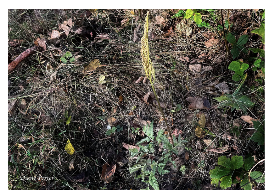
Cutleaf Grapefern, Sceptridium dissectum, is inconspicuous on the floor of the woodlands.

A mature cutleaf grapefern has only two fronds. The two fronds are about the same size, but they don't even look related.