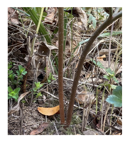
Fertile-frond stem and sterile-frond stem come up close together.

Some sporangia showed a crease around the equator, and one was splitting. I zoomed in on it and gave the gentlest poke with my needle. The crease parted, revealing the spores packed inside.